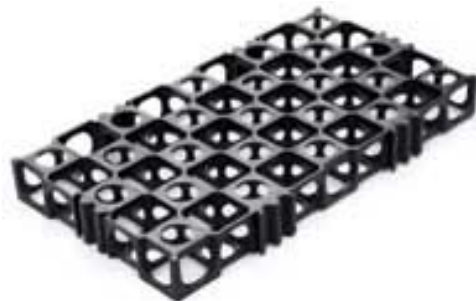
52 mm Drainage Cell