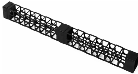
80/100 Geo Void Cell

Single layer of 52mm ESS Drainage Cell surrounded by ESS Geotex 225 FF (permeability of 314.85 L/m 2 /sec) was installed on the formation overlaid above by ESS Protection Board and the concrete base slab. 6 mm ESS Geocomposite Drainage Cell was placed vertically up the sides of the foundation concrete as a protection to eliminate the ingress of ground water.